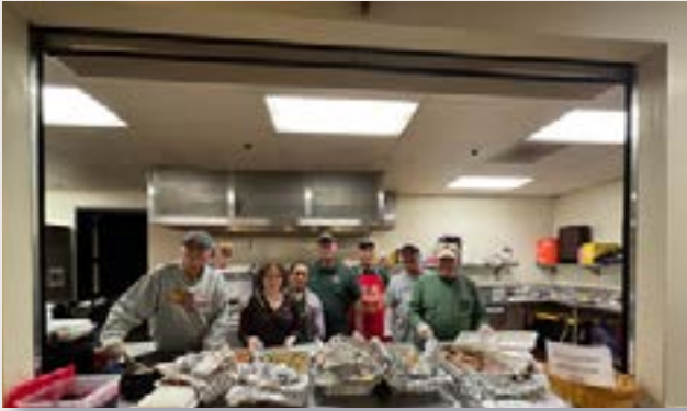
Serving Thanksgiving Turkey Dinner to our church community